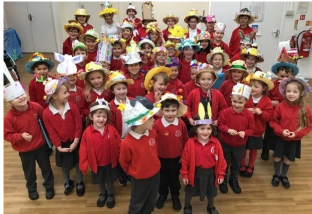
What a picture – Easter Bonnets on parade !

On behalf of the whole school team, we wish you a very happy and peaceful Easter break.