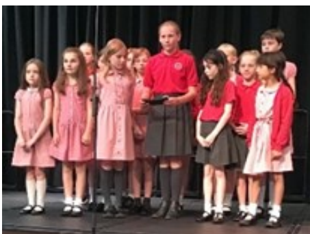
Chilton Foliat School Choir getting ready to sing, "As the Deer Pants for the Water, and A Million Brilliant Things."

"My thanks to you and your school for helping to make the event a very special one, and especially to you for all the support and commitment you give to the music cluster. What talented children you have, their singing was beautiful and moving, perfect choices too!"