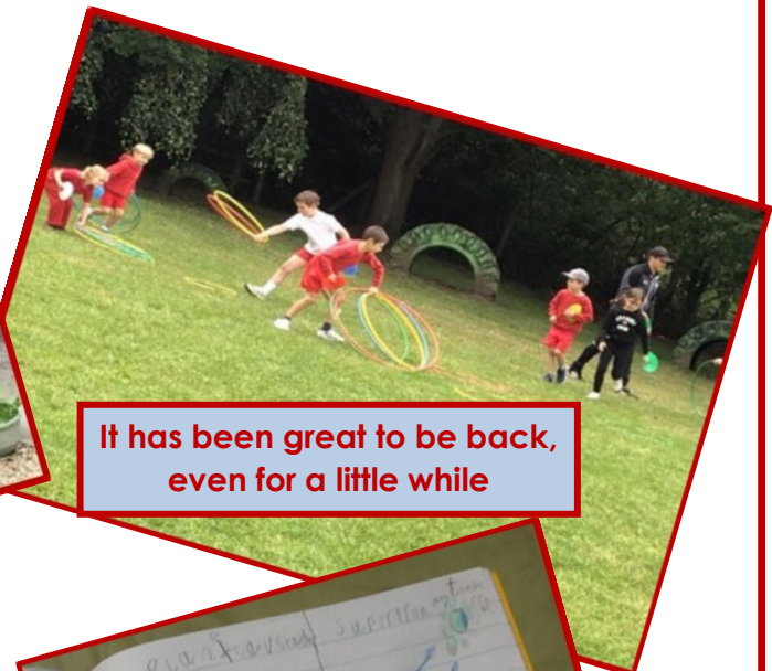
It has been great to be back, even for a little while