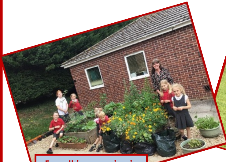
Everything growing in the garden

End of Term at Chilton Foliat. Have a great summer holiday, we can't wait to see you all in September!