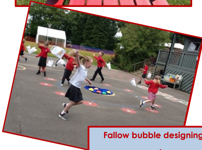
Fallow bubble designing and flying super-hero kites